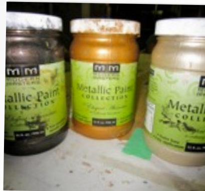
MM PRODUCTS USED